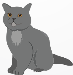
British Short Hair